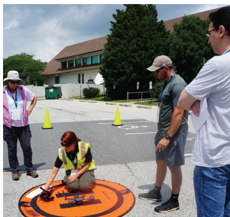
Learners attended our new Professional Drone Pilot Training course.

Keeping abreast of technology trends and their associated job projections, UD PCS partnered with industry-leading profes-